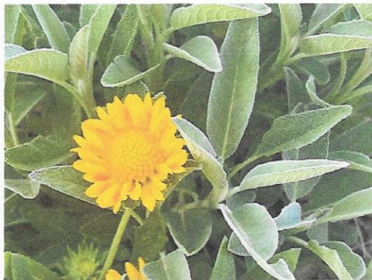
Yellow gaillardia (from the sunflower family) with foliage of kitchen sage behind. Contrast its radial symmetry with the flowers of Salvia nemorosa (below).

Living here as we do in the Great Basin, the term “sage” can be a bit ambiguous. Sagebrush is actually not a sage at all, but is in the genus Artemisia , a large group in the sunflower family (Asteraceae). The true sages are the largest genus ( Salvia ) in the mint family (Lamiaceae). Nearly all of us are familiar with the common sage of our pantries ( Salvia officinalis ), but there are nearly 1,000 other species of Salvia distributed worldwide, with the highest concentration in Central and South America. The tubular flowers in the mint family have bilateral symmetry (an imaginary vertical line would divide the flower into two identical halves). Many of us have probably seen nature videos that show bees or other insects feeding on flowers of the mint family. As the insect's weight pushes down on the lower lip of the flower, the upper lip comes down and stamps the plant's pollen on the insect's back, to be carried to another flower.