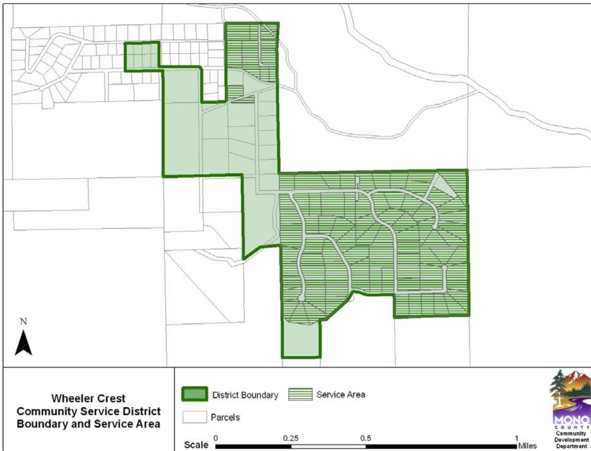
Figure 1 Wheeler Crest Community Service District Boundaries