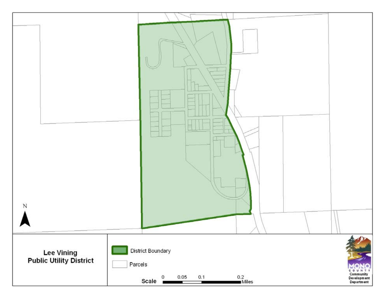
Figure 1 Lee Vining Public Utility District Boundaries