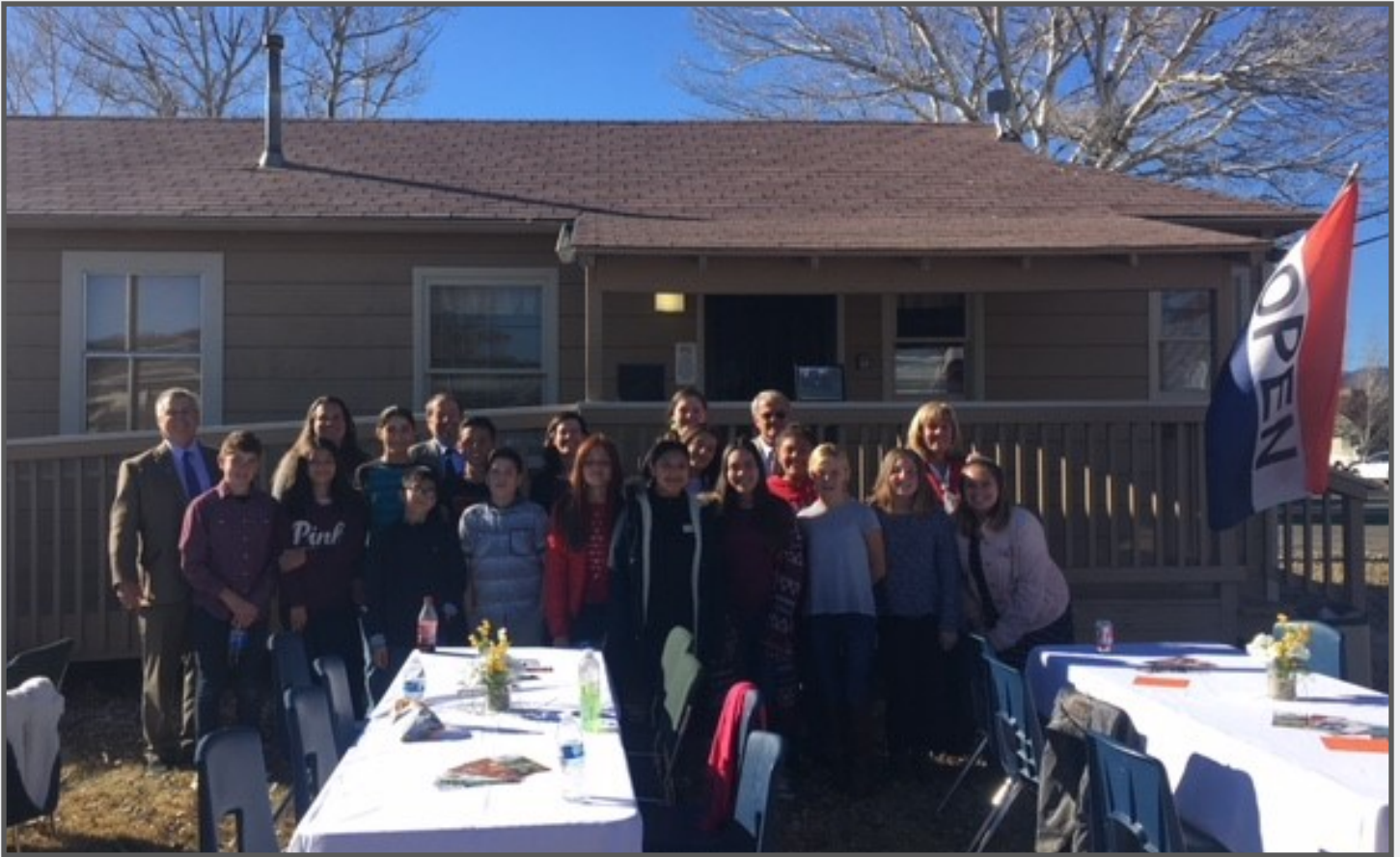
The Bridgeport Middle School students take time off from class on December 12th to host lunch, with white table cloths and all, for the Board of Supervisors and staff at the newly refreshed Bridgeport Visitor's Center.