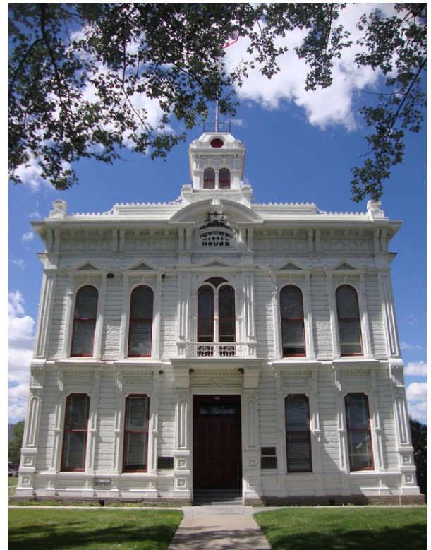
Mono County Courthouse Bridgeport, CA