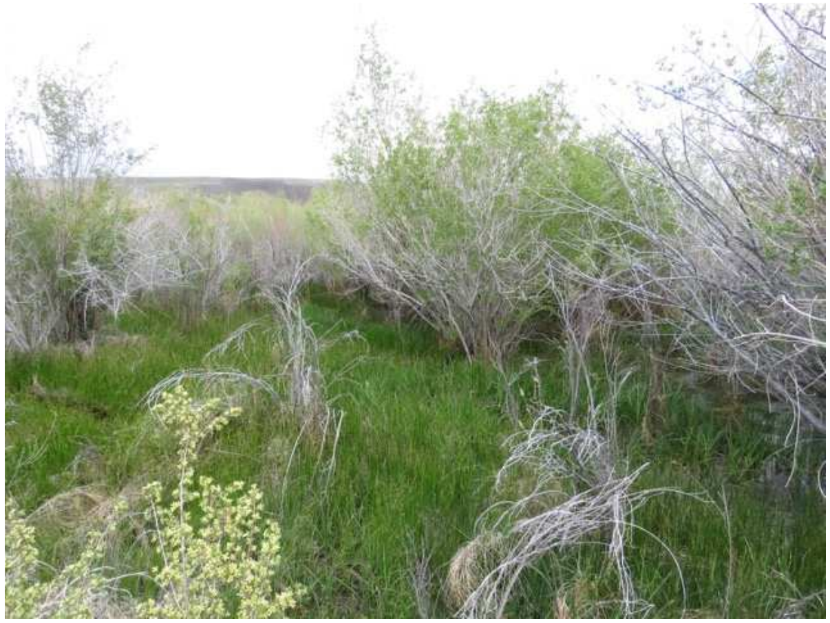
PLEASE NOTE: Mill Creek, shown below at the Cemetery Road crossing on 6/1/19, continues to have high flows, but now Wilson also has flows. Both creeks currently are supporting habitat.